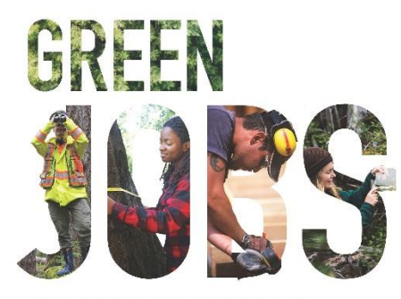
EXPLORING FOREST CAREERS

PLT's Green Jobs: Exploring Forest Careers Unit includes four hands-on instructional activities that help youth explore forest-related careers and get excited about green jobs. Given the content, these activities align with 3 SDGs and several specific targets – some of which overlap for the activities.