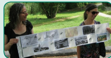
Traditional Poster Paper Timeline

Have children create a book or timeline that documents change over time in your town or community. It could include pictures, maps, copies of public records, and other documentation. Use photographs and poster paper or incorporate technology with a website (try ReadWriteThink's free timeline creator available at http://bit.ly/1gJMgon ) or an app such as "Timeline 3D" (available for purchase on iTunes).